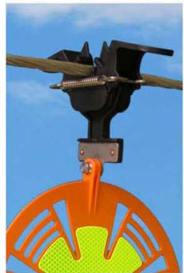
Part Number 1097 (6-16 Clamp)