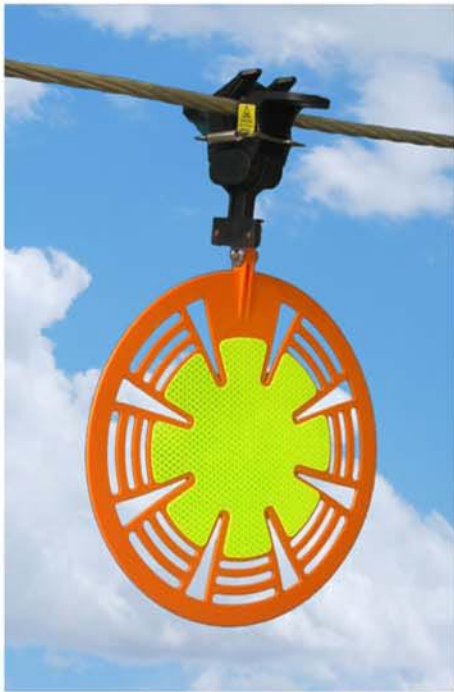
Part Number 1096 (10-70 Clamp)